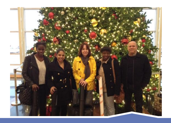
The Merry Gonzalez Group