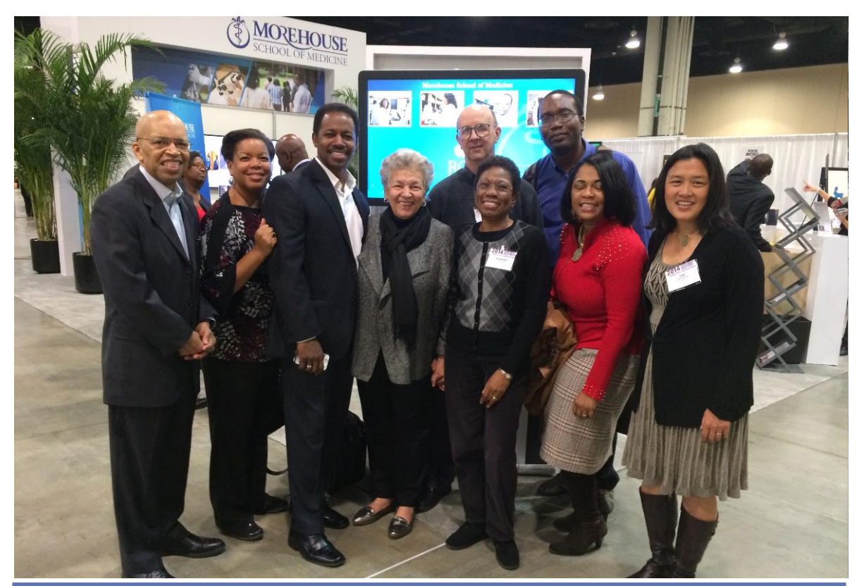
MSM booth at the National Institute on Minority Health & Health Disparities (NIMHHD) Conference Washington DC December, 2014