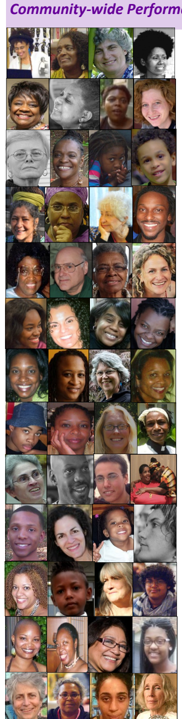
BE PRESENT, INC.

Participants will have an opportunity to create creative expressions of your experiences in this training workshop and share them at the Let's Make a Joyful Noise community-wide performance event on Saturday evening.