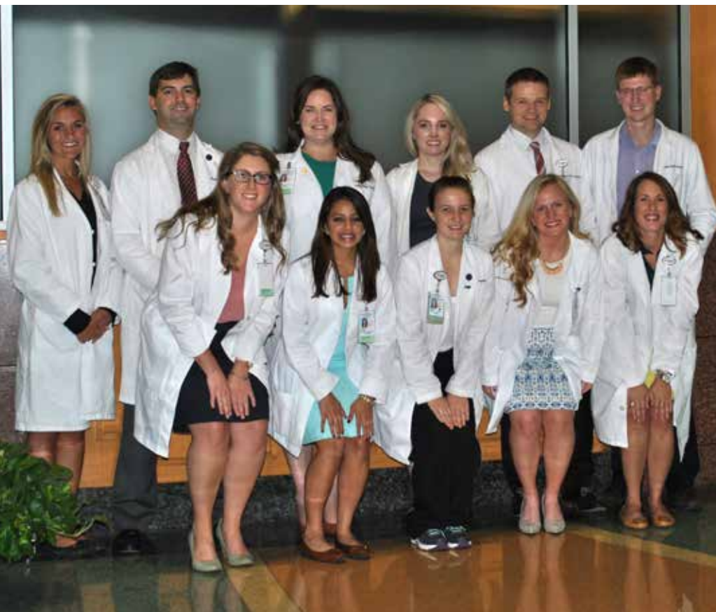
Welcome to our new Pharmacy Residents