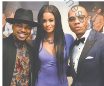
R&B singer Ne-Yo , from left; radio per-